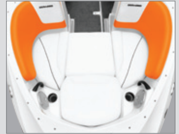
Bow filler cushion