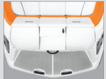
Walk-through to the swim platform