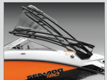
Folding arch tower with Bimini top