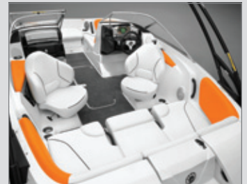
Spacious cockpit area