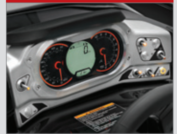
Premium helm with Cruise control, ECO mode, Ski mode and Docking mode